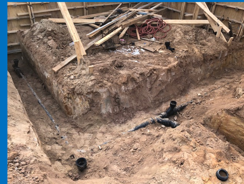
Plumbing Underground start at Gym Area