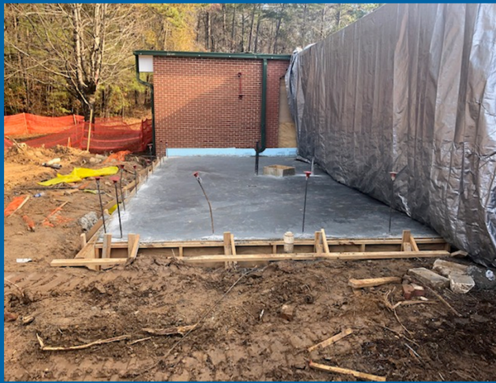
Admin Addition SOG Complete