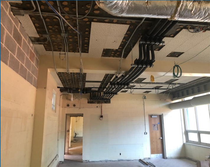
VRF Piping Complete at SW Wing for Pressure Test