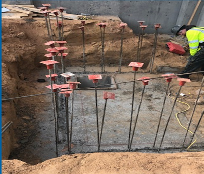
Elevator Pit Poured