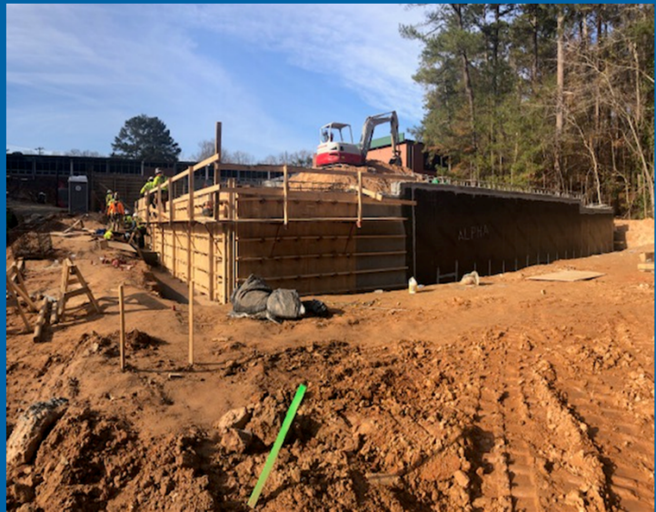
Gym Addition North/East Wall Concrete Pour and Waterproofing