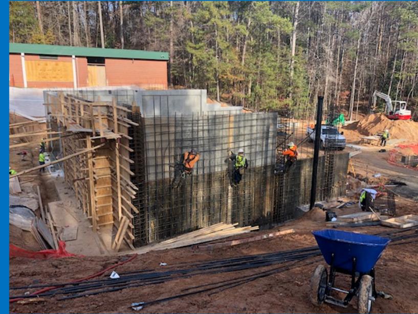
Continuation of Rebar and Formwork at Gym Area