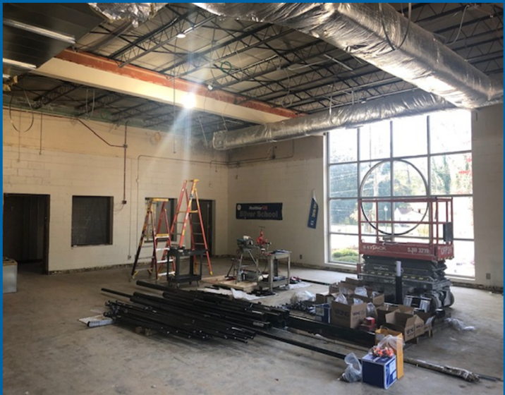
Cafeteria OH Installation On-going